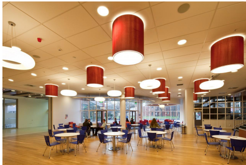
Main Common Room Near the Link area / opposite Auahi Ora

You might also be invited to be interviewed at another occasion! Such as, if we get enough Presidential candidates we will also run a spicy presidential debate!! Or on air in the studio with Radio One! More info later :)